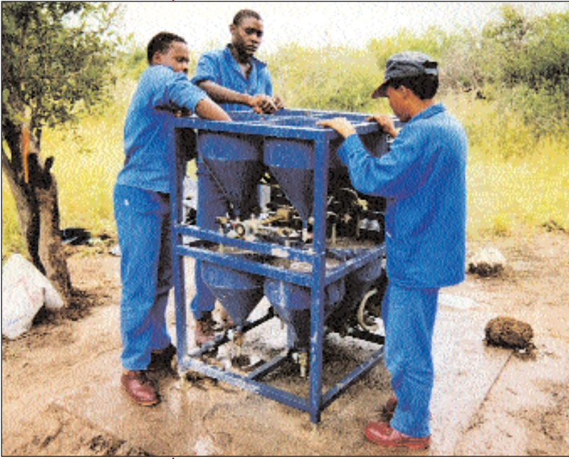
Field jigging to obtain heavy minerals at the Tsumkwe project in Namibia.

When we began our exploration campaign here in 1999, we soon realized that this indicator anomaly was a secondary anomaly – the diamonds and indicator minerals were eroding out of paleo-drainage sediments at the base of the Kalahari package. Once we had demonstrated this, we began the reconstruction of the basement topography and have been patiently following this model ever since, with several technical successes – during late 2001 and early 2002, we discovered three kimberlites in the