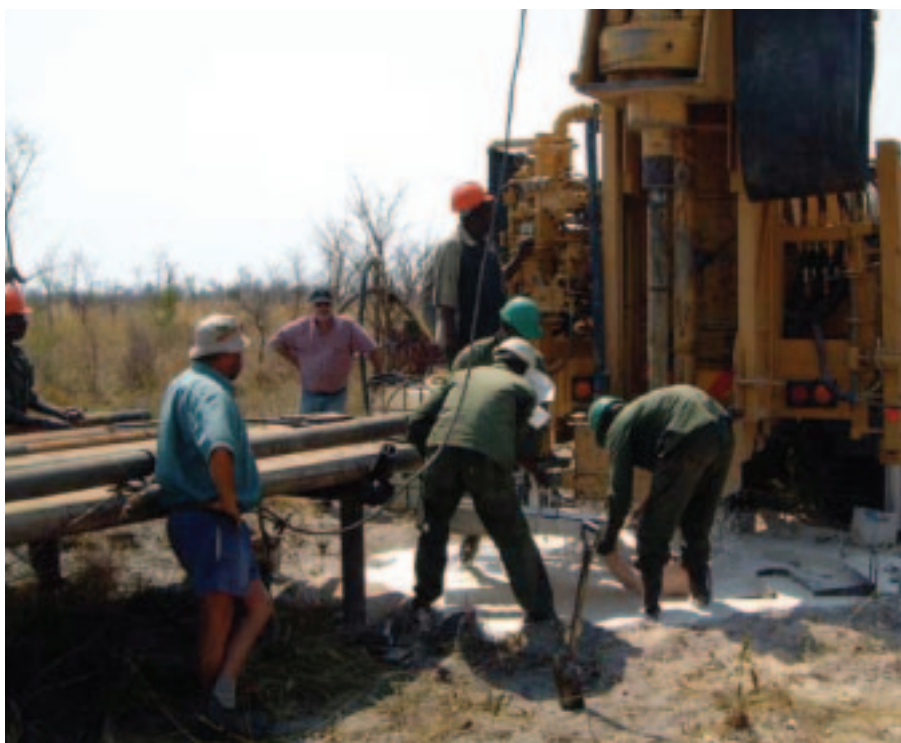
Ngamiland, Botswana drilling program